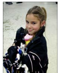
A kitten adoptee goes home with her new Mom!