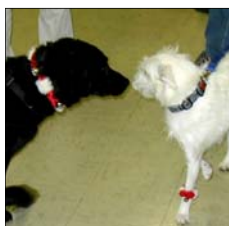
Canine adoptees Isis and Einstein go nose to nose.