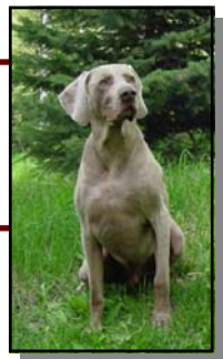
Toby 2005 PAWS Mascot