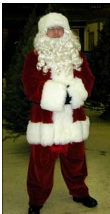
Thank you Santa!

The annual 2004 PAWS sponsored adoption event, Home 4 The Holidays , saw the successful adoption of 8 dogs, 13 cats and 2 rats! Scores of retailers, volunteers and area adoption organizations filled the Teton County Fair Building, all dedicated to one concern; helping to find holiday homes for orphaned animals. PAWS thanks everyone for their assistance and continued support for this wonderful event. See you in December!